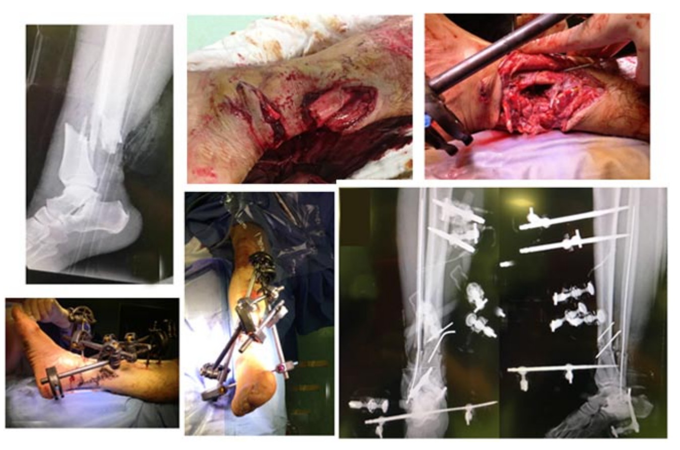
Figure 2. A 73-year-old male patient, traffic accident car vs. motorbike(own) with fracture.

(A) 43-B2 fracture according AO/OTA and open fracture Type IIIB according to Gustilo-Andreson associated with bone loss (B). After stabilization with Dolphix® External Fixator Frame, we found lesions of postero-medial compartment muscle (C) after wound exploration. Long Tibial calcaneal bridging external fixation due to skin lesions of the anterior-medial tibial part. Using Supplements from Base Kit (D-E) to achieve more biomechanical stability. The postoperative X-rays control shows a good reduction in sagittal plane, valgus deformity at the frontal plane (F). Stabilization of supra-sindesmosis fracture with K (F) wire.