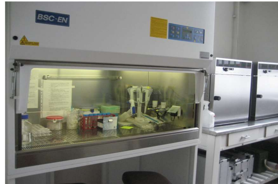
Figure 1: Microbiological laboratory for biological agents

design and construction of Biosafety Level facilities, in cabinet or suit configuration, schematic representations of such facilities have not been included. [5] (Figure 1)