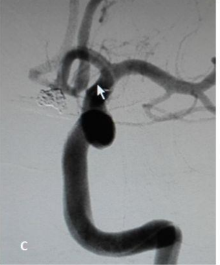
Figure 1. A 64-year-old female with a left AcomA aneurysm. A. Wide-necked aneurysm in the AcomA aneurysm; B. Simultaneous use of two microcatheters; C. Postembolic angiogram showing complete aneurysmal occlusion.