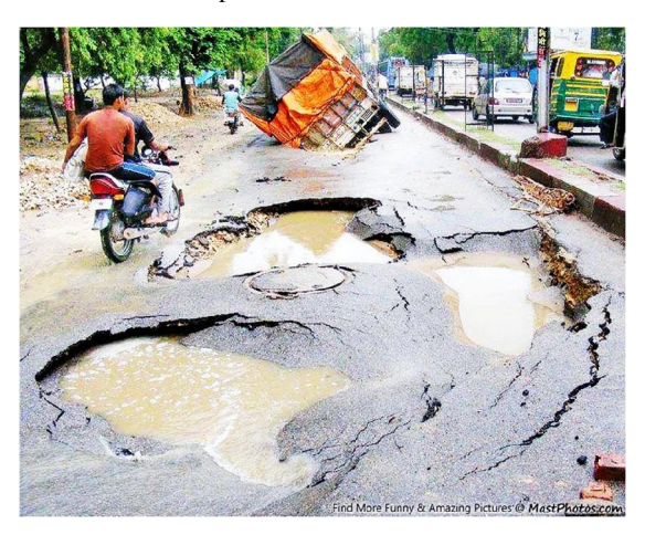
Image 5 : showing the Indian road condition in rainy season

Indian road condition is very critical and unsuitable for automatic vehicles. Many problems are in specially in rainy session by heavy rain road are fully full by the rain water and create holes on the road vehicles are trip and faces undesirable problems. Some rough roads are in village. In those conditions automatic car are not run properly and flat cars are not suitable for these roads. Because of very few height of car base to road that easily touch the road and fixed in the hole and damage the part of car. That's why in India only some expensive car are run on road and uses big size of vehicles are mostly use in India like bolero camper, Jip Truck ,Bus ,Taxi , Dustor car etc. Out of India mostly automatic cars are used and all type of vehicles are work on road. There is no holes and critical condition of road but in India road conditions are so unpredictable.