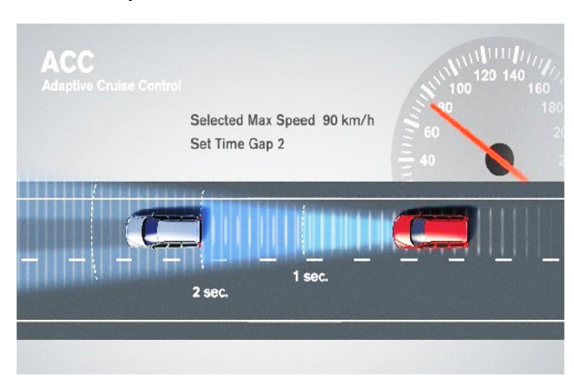
Image 2: showing the Adaptive cruise control continually adjusts the gap between vehicles based on your speed to ensure sufficient time to react.

Most of the automobile industries uses the LASER and RADAR system and mounted to the front of the self drive vehicle. It can be used to measure the gap between two vehicles. This data can be used to adjust the speed automatically between two vehicles.