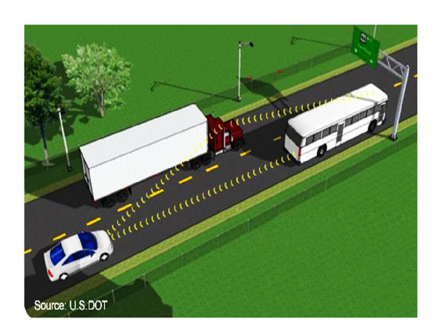
Image 7: showing the V2V communication between vehicles

braking, and loss of stability. This technology will help to warn driver about potential accidents and prevent crashes. This technology uses dedicated short-range communications (DSRC). This system will use a frequency of 5.9GHz, which is used by WiFi. The range is up to 300 meters or 1000 feet or about 10 seconds at highway speeds. V2V would be a mesh network, meaning every node (car, smart traffic signal, etc.) could send, capture and retransmit signals [10].