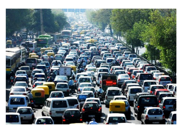
Image 6 : showing the Traffic jam condition in India

Traffic jam is one biggest problem due to road congestions, which tempt people to break traffic rules to escape the situation. This situation can be dangerous and often causing accidents. The other problem also occur like wastage of fuel, parking problem, air and noise pollution etc.