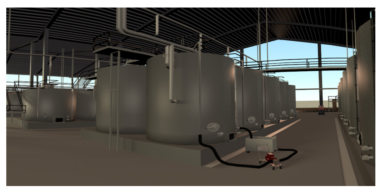
Figure 1: The virtual winery BITWINE 3D viewed from the floor. Note: Personal compilation.

General BITWINE description: BITWINE belongs to Universidad Católica del Maule and Universidad Santo Tomás, Chile. It is a VLE used for training and practicing job functions in winemaking, developed in Spanish by Unity<sup>®</sup> Game Development Engine and by ActionScript, Adobe Flash Player <sup>®</sup>. The program was designed in 3D and 2D environments to facilitate the understanding, as well as the processes of a modern winery, and it appears to be the first VLE approach in a modern winery in which the students actually experience "being there" (Figure 1).