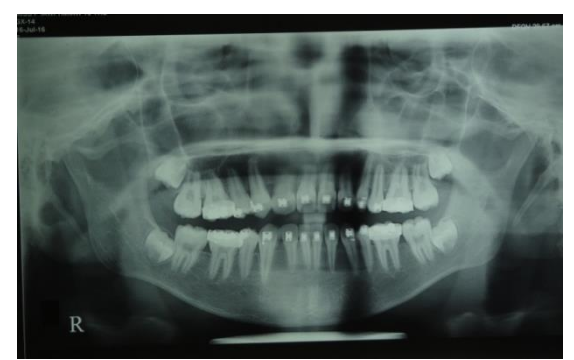
Fig. 8: Post treatment OPG