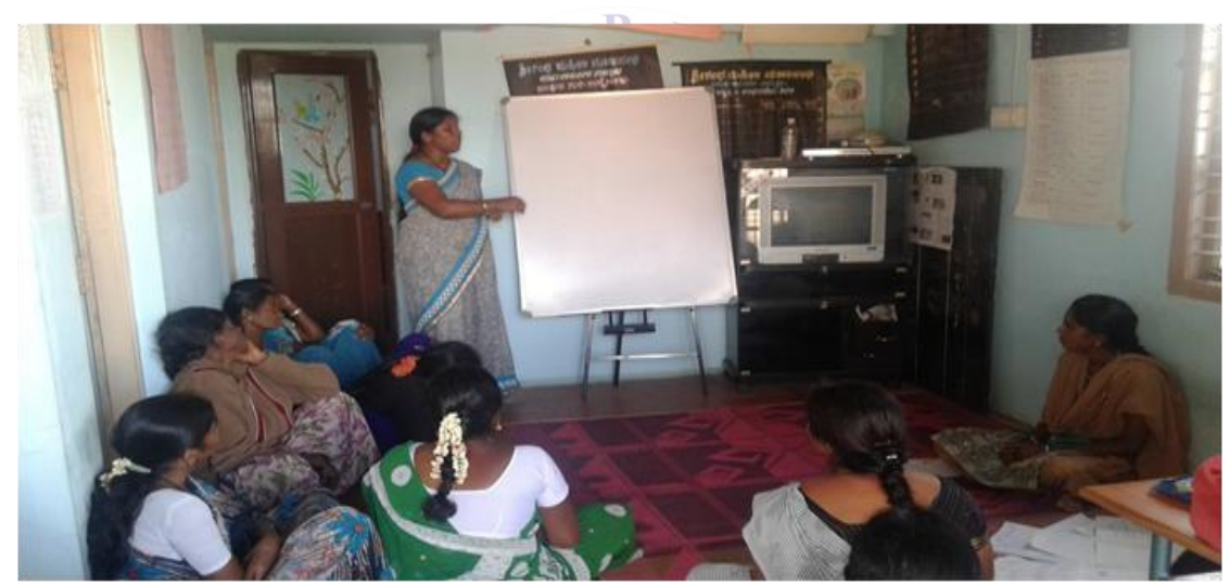
Fig. 2: Sri Gandha Mahila Maha Sangha, Executive committee meeting, CH Nagar