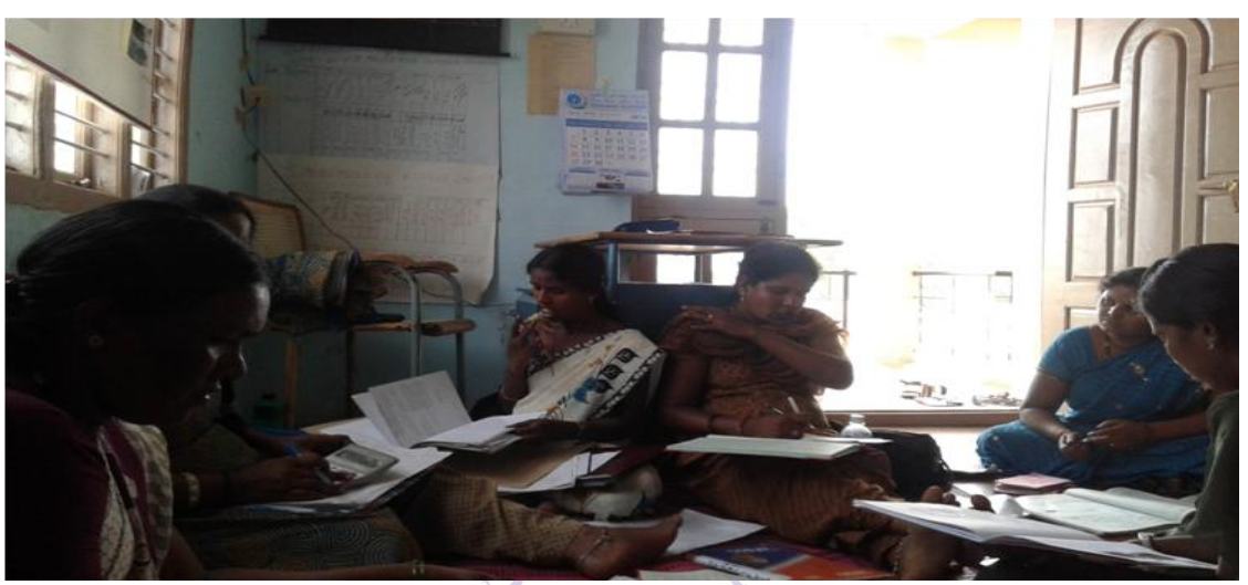
Fig.5: CRP meeting, Chamarajanagar