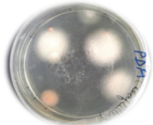
Fig 2: Fungi isolated from leaf litter F4