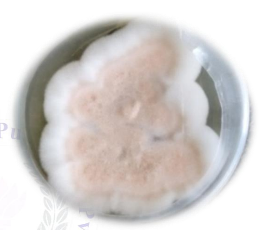
Fig 4: Fusarium pure culture