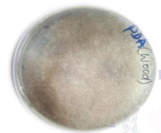
Fig 3: Fungi isolated from wood