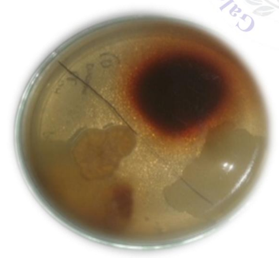
Fig.8 screening for laccase producer

All the isolates F1-F7 were tested for laccase activity according to the method of Kiiskinen et al which was confirmed with guaiacol assay. Among the 7 isolates, isolate F4 -Fusarium sps was positive for laccases (fig. 8). This was visualized by presence of brick red color around the mycelium and was considered as guaiacol oxidizing laccase secreting organism and hence it was used for further study.