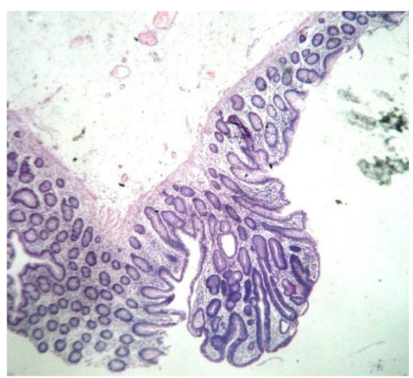
Fig. 2 (a): Histologic Slide of Adematous Polyp