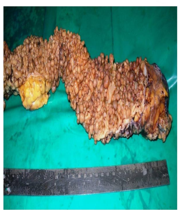
Fig. 1: Gross Specimen with numerous Polyps.

A 35 yr-year old woman was admitted with an 8-month history of passage of mucoid diarrhoeal stool, weight loss and generalised body weakness. Has no known family history of similar problem. On physical examination, the patient was weak and pale. Her abdomen was soft, non tender nondistended. without organomegaly, masses or as cites and rectal examination revealed normal findings. Laboratory investigation demonstrated haemoglobin of 7gm/dL and haematocrit of 21 %, stool occult blood test was positive and carcinoembryonic antigen was normal (1.0ng/ml), both serum electrolytes and liver function tests were normal. Colonoscopy revealed multiple polyps, involving whole sparing rectum and histology colon confirmed adenomatous polyposis coli. She was optimised and subsequently had total colectomy and ileorectal anastomosis. Patients recovered well and discharge home to be followed in out-patient clinic. Family members were counseled for screening.