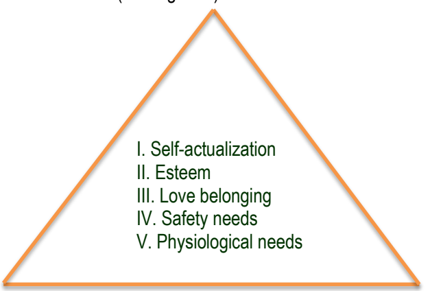
Figure 1. Maslow's Theory of Human Needs

The Foundation of individual motivations study was commissioned by Abraham Maslow (Sultan, 2009), through the work of A Theory of Human Motivation published in 1943 (see Figure 1).