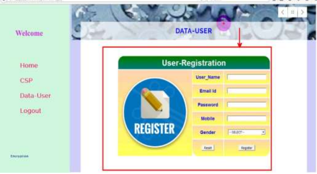
Fig. 6 Data User Registration page