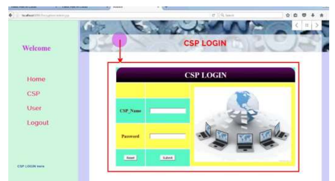
Fig. 9 CSP login page