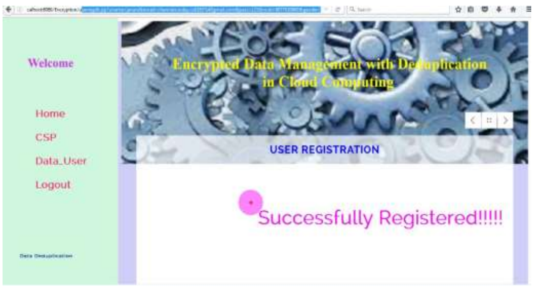
Fig. 7 Page after registration