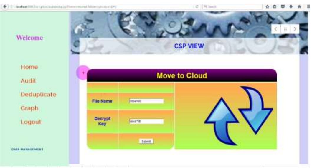
Fig. 10 To move file to the cloud