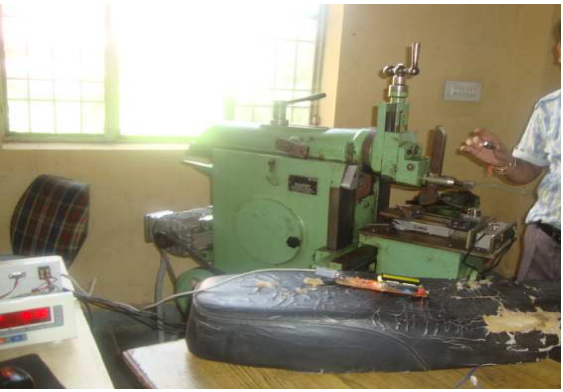
Fig. 4 Temperature Measuring Set Up