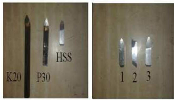
Fig. 5 Different Tool Materials& Shapes