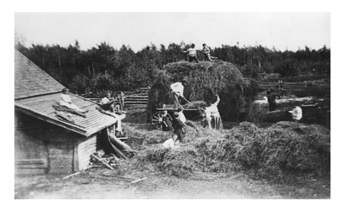
Fig. 4. Hay harvest in the colony (1925)

But labor should not be punishment or some chore. In that case, it will only have a negative effect. Shatskii claimed that labor must be systematic, replaceable and according to children's possibilities. Work must bring children positive emotions and real joy. Labor activities of pupils should be under the close attention of teachers who skillfully and tactfully direct, support and encourage them. The purpose of labor, according to Shatskii, is not only to master basic household skills, labor – is, above all, a tool that organizes a children's team on the principles of creativity, friendship and mutual assistance.