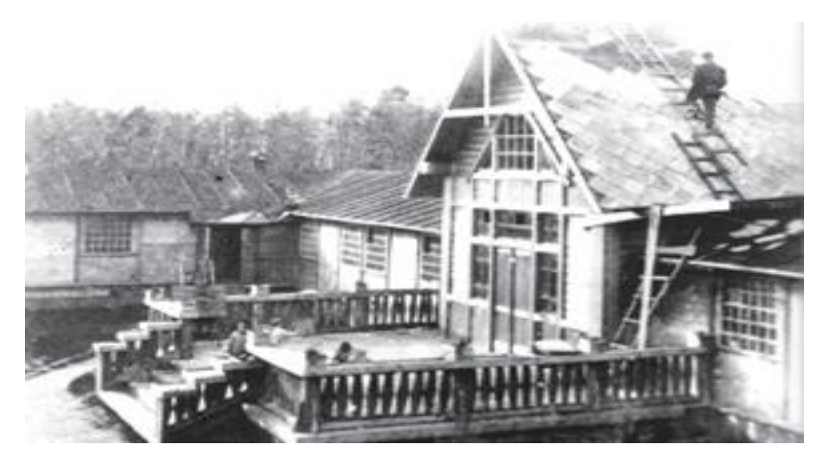
Fig. 3. Buildings of the colony "The Invigorating Life" (1911)

"The Invigorating Life" was a self-sustainable institution. There were built the following facilities in the territory of the colony: Shatskii's house (there were also an administrative office and a music room in Shatskii's house), a school building, a cook-house and a summer canteen house, a club-canteen building, a cellar, a power station, workshops, a dormitory, a dormitory for teachers, a club, a stadium, a radio antenna, a cattle yard, a vegetable garden, a fruit garden.