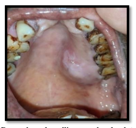
Fig. 1: Dome shaped swelling over hard palate

FNAC was done which showed negative aspiration. To assess the extent of growth and bony involvement, CT-PNS was carried out which showed a homogenously enhancing mass/lesion over left posterior part of hard palate with mild bony erosion. (Fig. 2)