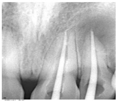
Master cone Selected