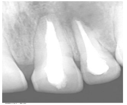
After root end resection