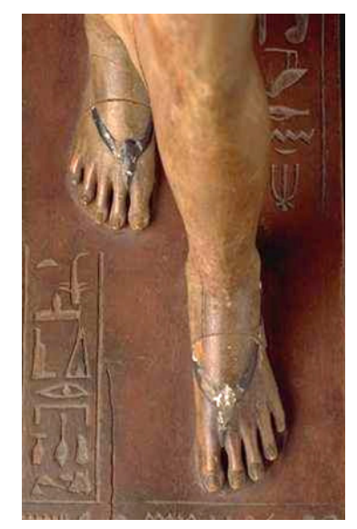
Fig.6 Pair of sandals from 12<sup>th</sup> Dynasty [15].

1650 BC) sold by Christies on October 2010 at London for 9,026 US$ and shown in Fig.7 [16]. The leather straps were supported near the end of the sandal by two split poles simulating a human foot for better fixation and stability during sandal use in a brand new mechanical design.