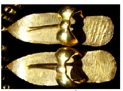
Fig.22 Golden sandals from 18<sup>th</sup> Dynasty [28].

The fourteenth example is a pure pair of golden sandals for Pharaoh Tutankhamun (1332-1323 BC) in display in the Egyptian Museum at Cairo and shown in Fig.22 [28]. The straps were joined directly to the soles and the sole surface was roughened specially near the end to prevent unstable use of the sandals. This was the thinking of the mechanical engineers in ancient Egypt more than 3320 years ago. Besides all the surfaces are rounded to prevent any injury during use. Technology we are missing nowadays.