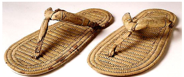
Fig. 9 Pair of sandals from Early 18th Dynasty [18].

The first example is a papyrus fibre sandal from Early 18<sup>th</sup> Dynasty (1580-1479 BC) in display in the Metropolitan Museum of Art and shown in Fig.9 [18]. The sandal was produced using the coiling technique used in the basketry industry [19]. The three branches strap ends are joint directly to the sole of the sandal without need to intermediate poles as in the designs in Fig.8. Even though this sandal was produced from a plant fibre, it looks neat, well produced and in a good condition after more than 3480 years.