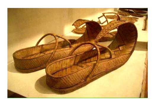
Fig.15 Papyrus shoes from 18<sup>th</sup> Dynasty [24].

- The eighth example is a 198 mm pair of sandals for Pharaoh Amenhotep I of the 18<sup>th</sup> Dynasty (1524-1503 BC) in display in the Metropolitan Museum and shown in Fig.16 [25]. This sandal model was produced from stained calf skin and had a very thin sole having a thickness of only 2 mm. The straps were directly joined with the sole without any poles.