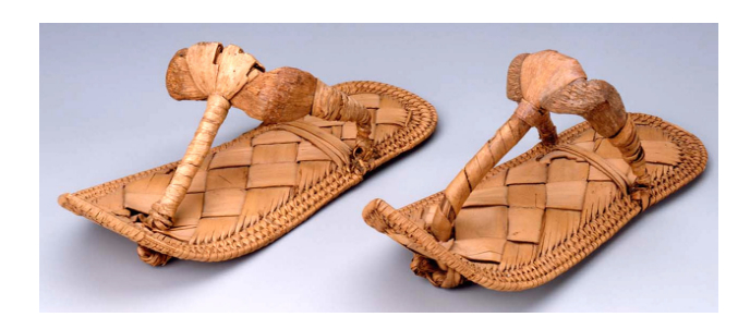
Fig. 14 Sandals from 18<sup>th</sup> -19<sup>th</sup> Dynasties [23].

shown in Fig.15 [24]. This is a unique design in which the front of the sole took the shape of a tongue of decreasing width was turned back to reach the straps of the shoes. I could not trace its present location!!.