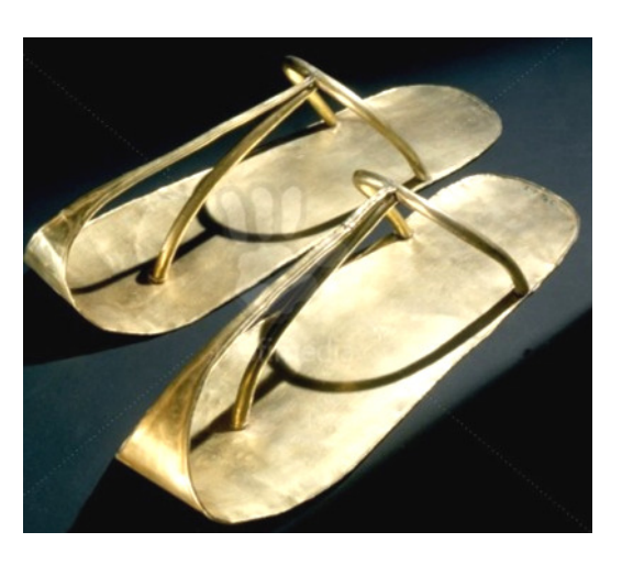
Fig.26 Golden sandals from 22<sup>nd</sup> Dynasty [32].

- The second example is a golden pair of sandals for Pharaoh Sheshonq II from the 22<sup>nd</sup> Dynasty (887-885 BC) in display in the Egyptian Museum at Cairo and shown in Fig.26 [32]. This is again a new design for the Royal Egyptian sandals. The straps were designed as a two fork-elements, one element joined with the sole and the other was joined with first one and the toe. The front end of the sole was thinned gradually until its connection with first fork-element.