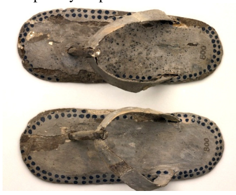
Fig.4 Pair of sandals from Middle Kingdom [13].

pair of sandals was produced wood and gesso. The straps may be produced from leather.