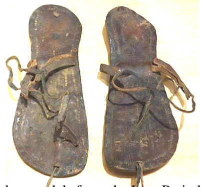
Fig. 28 Leather sandals from the Late Period [34].