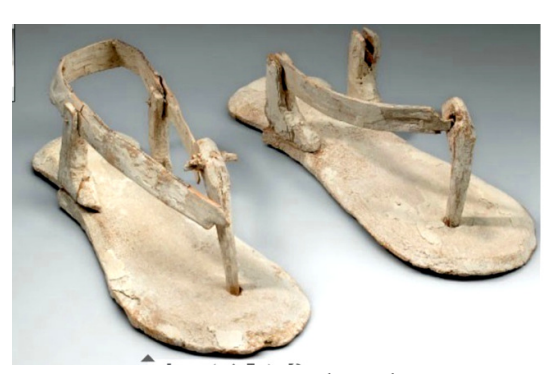
Fig.7 Pair of sandals from 12<sup>th</sup> -13<sup>th</sup> Dynasties [16].