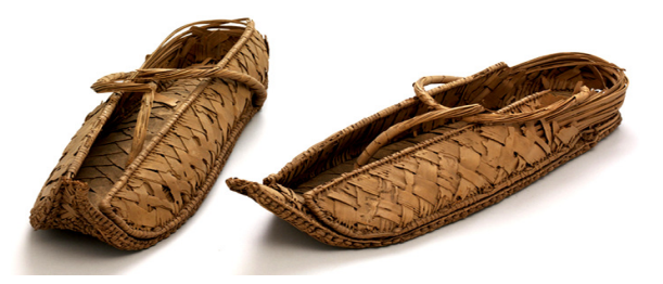
Fig.13 Reed shoes from 18<sup>th</sup> Dynasty [22].

The fifth example is a pair of reed shoes from the New Kingdom (1550-1070 BC) from the collections of Major Myers and shown in Fig.13 [22]. This is the first shoes appeared during the New Kingdom more than 3100 years ago. It was sewn using reed, open from the top and had a single-loop tie to keep the shoes secured on the foot.