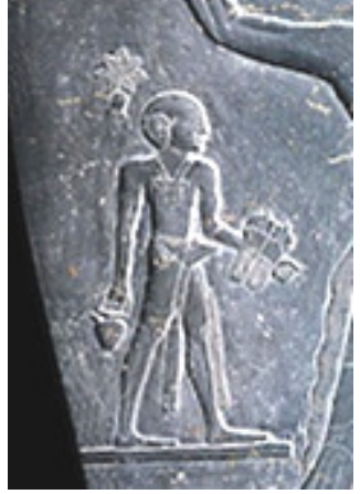
The King The sandal bearer Fig.1 Narmer palette from 1<sup>th</sup> Dynasty [10].