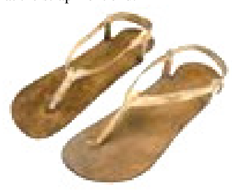
Fig.5 Pair of sandals from 11th Dynasty [14].

The third example is a pair of sandals for Mesehti, the Mayor of Asyut during the 11<sup>th</sup> Dynasty (2000 BC) in display in the Egyptian at Cairo and shown in Fig.5 [14]. The sandal was produced from wooden soles and white leather straps. The straps was guided by two vertical poles near the back of the sandal while there was no pole at the strap front end.