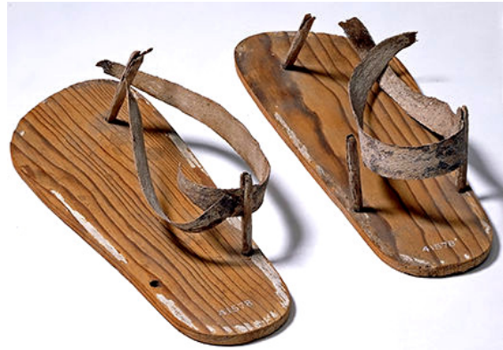
Fig.8 Pair of sandals from 13<sup>th</sup> Dynasty [17].

straps. The straps were supported using three vertical poles, one in the front and two near the ends of the sandal in a brand new mechanical design.