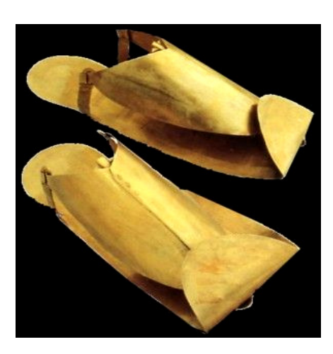
Fig.25 Golden sandals from 21<sup>st</sup> Dynasty [31].

- The second example is a golden pair of sandals for Pharaoh Sheshonq II from the 22<sup>nd</sup> Dynasty (887-885 BC) in display in the Egyptian Museum at Cairo and shown in Fig.26 [32]. This is again a new design for the Royal Egyptian sandals. The straps were designed as a two fork-elements, one element joined with the sole and the other was joined with first one and the toe. The front end of the sole was thinned gradually until its connection with first fork-element.