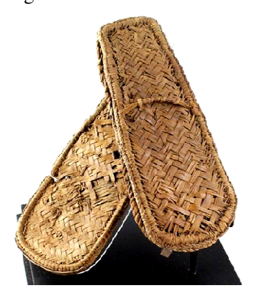
Fig.12 Plaited sandal from 18<sup>th</sup> Dynasty [21].

sewn from reed while some of the straps are missing.