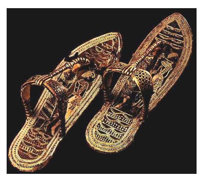
Fig.23 Golden-inlaid sandals from 18<sup>th</sup> Dynasty [29].

The fifteenth example is gold inlaid wooden sandals of Pharaoh Tutankhamun from the 18<sup>th</sup> Dynasty (1332-1323 BC) in display in the Egyptian Museum and shown in Fig.22 [29]. This piece represents the top technology in the ancient Egyptian footwear production. The designer used a cheap material for the sole (wood) but covered it completely through inlay with gold and another colored materials in a wonderful scenes on all the elements of the sandals.