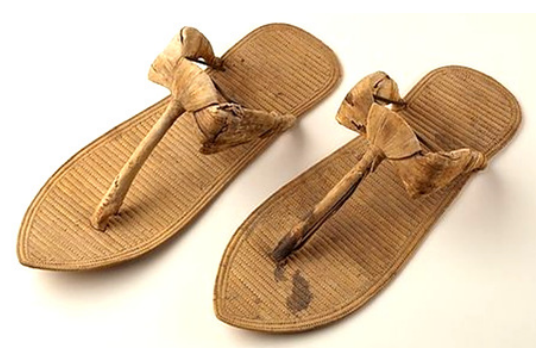
Fig.20 Plant sandals from 18<sup>th</sup> Dynasty [26].

- The twelves example is a 304 mm pair sandals from the reign of Pharaohs Amenhotep III (1390-1352 BC) of the 18<sup>th</sup> Dynasty in display in the Metropolitan Museum of Art at NY and shown in Fig.20 [26]. It was produced from plaited grass and reed, while the toe and sides were produced from papyrus. Even though this sandal was produced from plant materials it looks very neat and in a good condition after more than 3360 years. The straps were joined directly to the soles without poles.