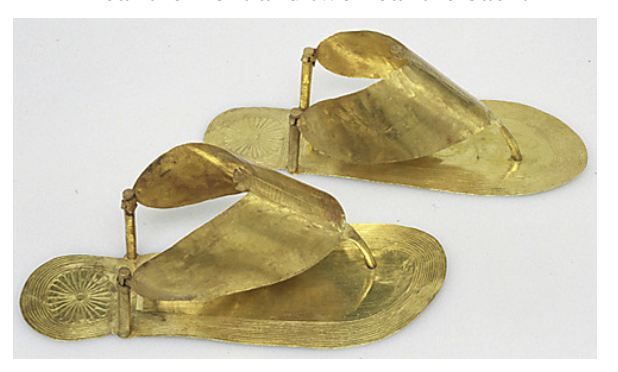
Fig.19 Golden sandals from 18<sup>th</sup> Dynasty [18].

Museum of Art and shown in Fig.19 [18]. They were produced from pure gold using multiple processes such as metal casting and sheet forming. The straps were wide and secured to the sole through three poles, one near the front and two near the back.