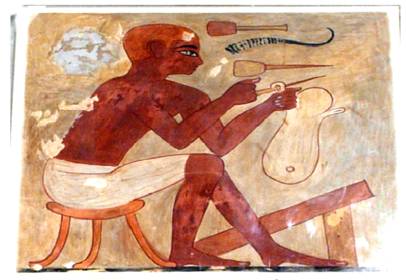
Fig.17 Footwear maker from 18<sup>th</sup> Dynasty [18].

- The ninth example is a scene of a sandal maker from the tomb of Vizier Rekhmire of the 18<sup>th</sup> Dynasty (1479-1398 BC) shown in Fig.17 [18]. The figure depicts the footwear maker setting on a stool and working in assembling a sandal using his tools shown in the scene. He is using an inclined stand to support the sandal while working in it.