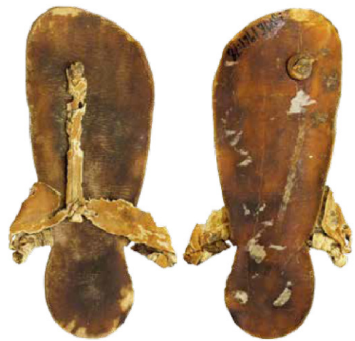
Fig.11 Leather sandals from the New Kingdom [5].

- The third example is a leather-eared-sandals from the New Kingdom (1570-1069 BC) in display in the Medelhavsmuseet Museum, Stockholm, Sweden and shown in Fig.11 [5]. Its design is similar to that in Fig.9 except the material which was leather.