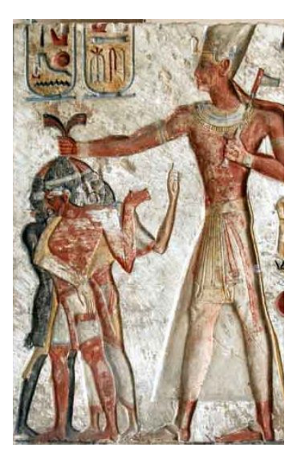
Fig.24 Scene of Ramses II from 19<sup>th</sup> Dynasty [30].

21<sup>st</sup> Dynasty (1007-1001 BC) in display in the Egyptian Museum at Cairo and shown in Fig.25 [31]. This is a brand new design of sandals of ancient Egypt. It was produced from a pure gold sheet. The front of the sole was turned back while the straps were extremely wide. The back ends of the straps were connected to the sole through vertical poles. The front connection of the straps to the soles is not clear in the image because of the turned-back sole.