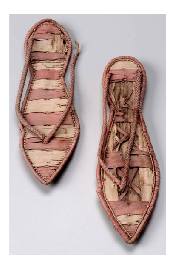
Fig.27 Striped sandals from Late Period [33].

without special poles to raise the levels of the strips.