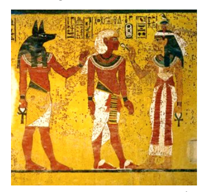
Fig.21 White strap sandals from 18<sup>th</sup> Dynasty [27].

Thebes and shown in Fig.21 [27]. The pharaoh was shown wearing a white straps sandals. It is not strange that the artist selected a white color for the Pharaoh's sandals. The Pharaoh's tomb contained 10's of sandals and shoes of the Pharaoh with different designs and colors.