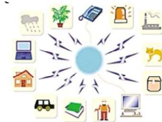
figure 1 internet of things for smart institute

* Internet connects all people, so it is called "the Internet of People"