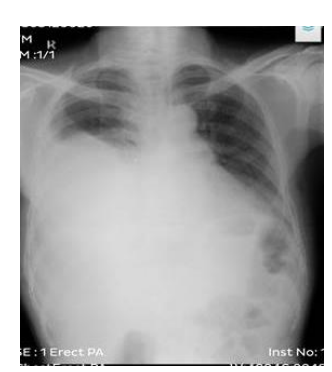
Fig. 1: Chest X-ray PA view showing right sided pleural effusion

We also done Ultrasonography guided Fine Needle Aspiration Cytology from the swelling in front of right sided third rib [anterior end] which was suggestive of lesion of plasmacytoma. A bone marrow study was performed in which the bone marrow aspirate revealed 62% of cells as plasma blast and plasma cells with large binucleated nuclei suggestive of multiple myeloma (Fig. 2). His Contrast enhanced computed tomography of the thorax was suggestive of erosion in the anterior end of right 3<sup>rd</sup> rib (Fig. 3). Serum protein electrophoresis showed a monoclonal band confirming multiple myeloma. Patient was started with the treatment of thalidomide, melphelan corticosteroids. He was doing well on follow up; his pleural effusion subsided subsequently with this treatment.