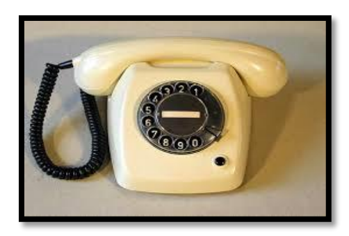
Exhibit 3: Landline phones in 1960s