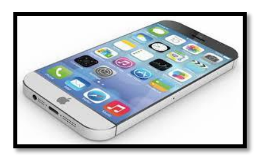
Exhibit 1 Landline phones in 1960s

So to overcome the wire syndrome the marketers developed a cordless phone which also called portable telephones which also communicated using radio frequency signals instead of wires attached to it. It had frequency mechanism to connect the call to the other end. This was a boon to generation Y as they would now communicate hassle free as per their convenience. But as generation grew up there were new innovations required which would satisfy them. The problems faced were it had a mobility which was restricted to a few meters distance only. With evolving generation communication was not only the main aim which a consumer was looking for. The generation Z wanted to do more with it. This vision was designed and developed by various marketers who conceptualized the design of a fully portable telephone called mobile. This was eventually developed to have extra functionalities like alarm, connect to internet, games, to do list which gradually converted it in to a smart phone device making us fully dependent on it. Today's smart phones have become the need of the hour. It can be viewed as the basic physical need one tries to achieve and fulfill for its existence as described by Maslow's hierarchy.