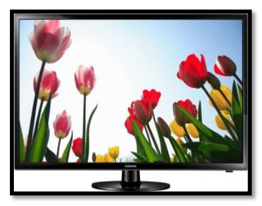
Exhibit 2: LCD TV