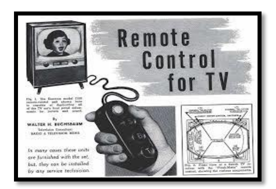
Exhibit 1: Remote Control TV

With increase in technology new innovations like Smart TV and internet enabled TV have high demand among the masses. Today's Generation Z wants to fulfill their hedonic needs which marketers are trying to capture through innovations.