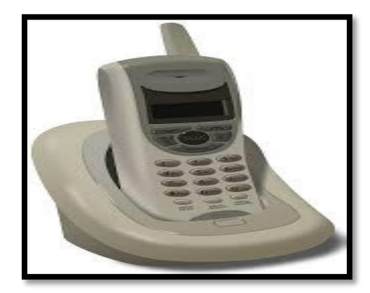
Exhibit 2 Wireless telephone era