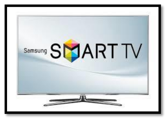
Exhibit 3: Generation Z Smart TV