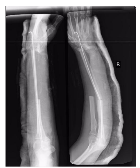
Fig. 3: X ray after excisional biopsy and fibular grafting