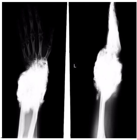
Fig. 1: X ray antero-posterior and lateral views of left forearm with wrist showing radiodense circumferential swelling involving lower third of radius, ulna and interosseous space

The patient remains asymptomatic 24 months after the surgery.