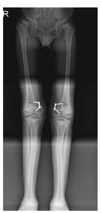
1. Preoperative clinical image; 2. Immediate postoperative radiograph; 3. 18 months followup radiograph Fig. 1: