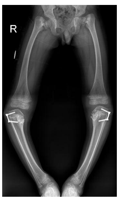
1. Preoperative clinical image; 2. Immediate postoperative radiograph; 3. 18months followup radiograph Fig. 3:

In the present study no case of implant breakage and loosening was encountered. One patient had early physeal closure. Two patients presented with superficial infection at the surgical site, which were resolved after treatment with IV antibiotics and dressing. In this study