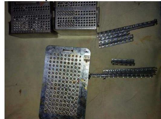
Fig. 3: DCP and 3.5mm cortical screw set and cancellous screws