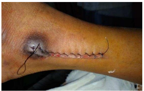
Fig. 14: Closure of lateral malleolus

Approach to the medial Malleolus: A 10-cm longitudinal curved incision on the medial aspect of the ankle, with its midpoint just anterior to the tip of the medial malleolus was made. Periosteum was elevated at fracture site and edges were freshened. Reduction was done under direct vision and periosteum interposition between fracture edges was avoided. Medial malleolus wasfixed with partially threaded 4mm cancellous screws directed obliquely upwards.