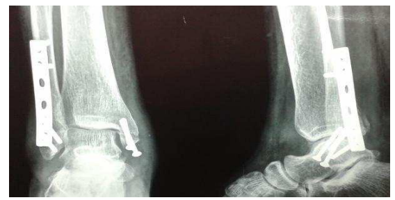
Fig. 18: Antero-posterior and lateral view radiograph at union 10 week