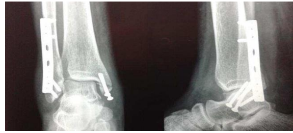
Fig. 17: Antero-Posterior and lateral view radiograph at 6-week