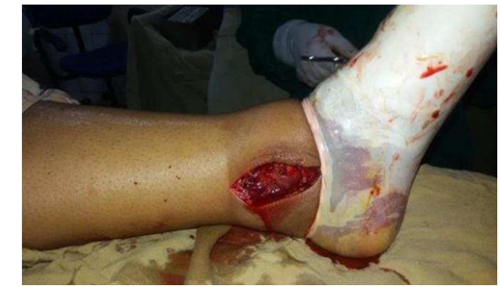
Fig. 4: Medial malleolus exposure