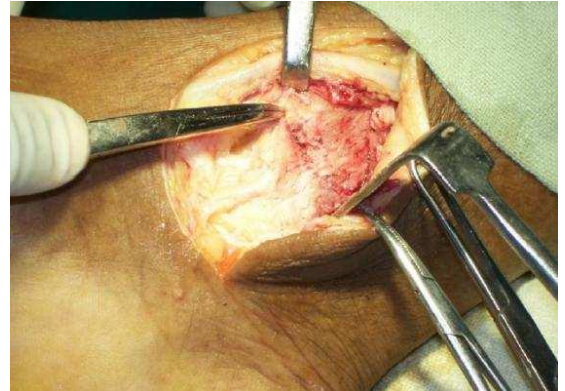
Fig. 7: Medial malleolus reduction