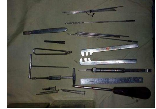
Fig. 1: Basic instrument set

The medial malleolus was fixed with 4mm cancellous screws in 60 cases. Of which six were single screw and additional k-wire due to small fragment while other 54 cases two screws were used. The lateral malleolus was fixed with Dynamic compression plate in all 60 patients.