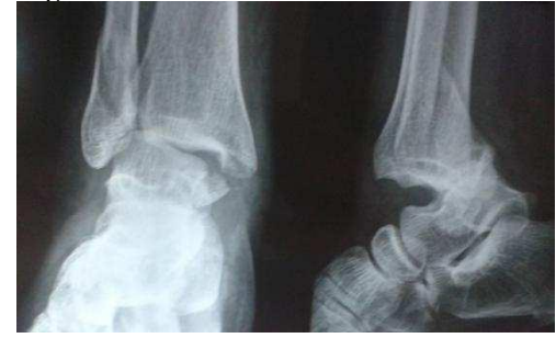
Fig. 15: Antero-posterior