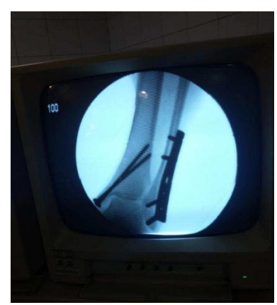
Fig. 11: Post-operative intensifier image