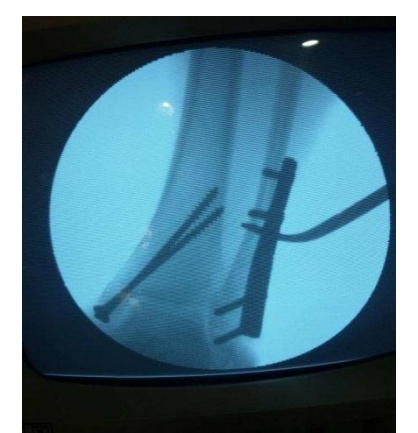
Fig. 12: Cotton test for syndesmotic