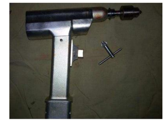
Fig. 2: Image showing Power drill