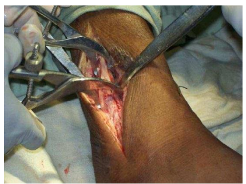
Fig. 9: Lateral malleolus reduction