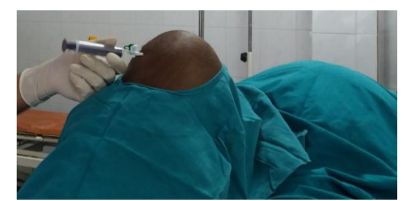
Fig. 2: Infiltartion of PRP into Rt knee

function of hyaline cartilage and its inherent low healing potential. For therapeutic intervention, laboratory investigations are focusing on the possibility of preserving normal homeostasis or blocking or at least