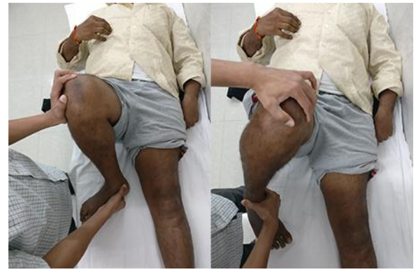
Fig. 3: Clinical demonstration of Mc murrays test

No symptoms of meniscal tears were observed in 32 of the 34 cases (Table 1) in their last follow-up which also included 3 cases of meniscal repair done in the white-white zone. Hence, 94% cases were considered as clinically healed. Of the other two cases, one patient had joint line tenderness, and the other had a positive McMurray's test (Fig. 3) during follow-up. None of the patients had any locking episodes. The overall Lysholm score increased to a mean value of 95.2 as compared with the preoperative mean value of 61.5 (p <0.0001). In 9 cases where isolated meniscal repair was done, the Lysholm score on an average increased to 97% postoperatively from a preoperative score of 65.8% (Table 2). In the 25 cases where ACL reconstruction was combined with meniscal repair, the Lysholm score increased from 60.0% preoperative to 94.5% postoperative (Table 3).