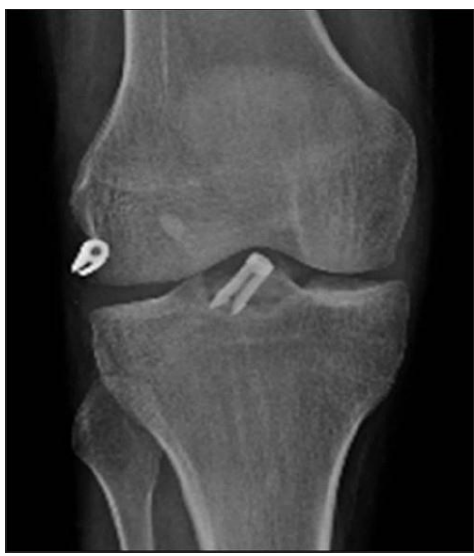
Fig. 6: Anteroposterior X-ray of the right knee showing back out of the staple in a 26 year old male

One patient had back out of one staple 8 months after surgery in which two staples were used [Fig. 6]. The backed out staple was removed arthroscopically and the patient was able to return to his pre-injury activity level. Routine removal of the staple is not advocated. However we recommend removal of the staple if there is loosening or backing out radiologically. Otherwise the backed out staple can cause impingement and articular cartilage damage.