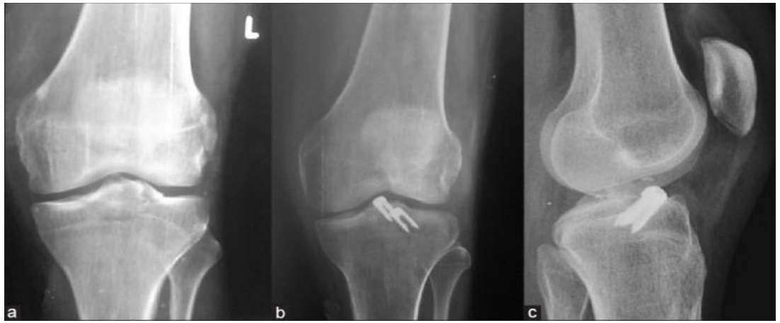
Fig. 3: (a) Anteroposterior X-ray of left knee of a 39 years old male shows large ACL avulsion, (b) Postoperative Anteroposterior and (c) lateral view of the same patient shows ACL fixed with 2 staples

The associated ipsilateral injuries of the knee were managed simultaneously. In our series associated knee injuries was found in seven patients. Out of these, three patients had tibial condyle fractures which were fixed percutaneously with screws before ACL avulsion fracture fixation for better purchase of the staple [Fig. 4]. Partial menisectomy was done in two patients who