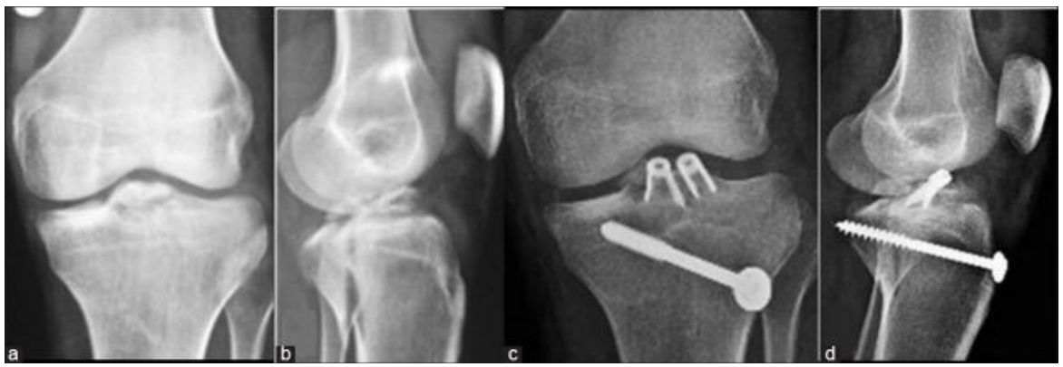
Fig. 4: Anteroposterior (a) and lateral (b) radiograph of the right knee of a 35 year old female shows ACL avulsion and posterior condyle fracture fixed respectively with staples (c,d) and percutaneous cancellous screws