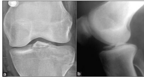
Fig. 1: Plain radiograph anteroposterior (a) and lateral view (b) of right knee of a 28 year old man with ACL avulsion fracture

All patients were assessed in the casualty by a careful physical examination to rule out associated injuries and by a plain radiograph of the knee joint [Fig. 1]. On assessment, it was found that around thirteen patients had type II injury of the ACL (anterior third displacement of the avulsed fragment) and nine patients had type III injury of the ACL where the avulsed fragment was displaced completely. There was exclusion of patients with polytrauma and contra lateral limb injuries from this study while patients with associated ipsilateral knee injuries were included.