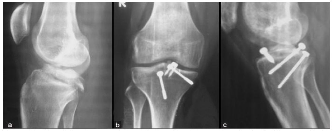
Fig. 5: ACL and PCL avulsion fracture of the right knee in a 47 year old male fixed with screws for PCL and staples for ACL

All patients were mobilized partial weight bearing for the first 4 weeks with a knee brace followed by full weight bearing along with knee bending exercises from 4 weeks postoperatively. This was followed by an active rehabilitation program which was started to gradually attain the full range of movements. Functional evaluation of the patients was done by examining for clinical signs of laxity and assessment by the Lysholm score and the International Knee Documentation Committee (IKDC) score at end of third and sixth month and at final follow up. Follow up radiographs were done to assess the radiological healing in these patients.