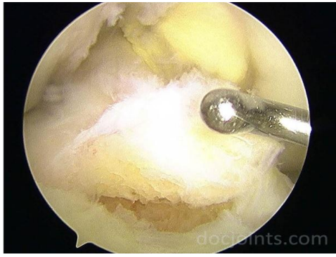
Fig. 3: Tibial spine avulsed fragment

Surgical Technique: The patients were operated by the same surgeon within 21 days of the injury. Under spinal anesthesia the patients were placed in supine position and diagnostic knee arthroscopy was performed under a tourniquet. The basic principles of suture fixation of the avulsion fractures described by Lee<sup>6</sup> in 1937 using open techniques were followed. Arthroscopy pump was used to control bleeding and improve visualization. After evacuation of the hematoma the joint was thoroughly inspected for associated injuries. Meniscus and cartilage issues were addressed appropriately before tibial spine fracture reduction was done. The crater on tibia was freed of any soft tissue and fracture fragments. The tibial spine avulsion fracture fragment was reduced by gentle manipulation. Any intervening soft tissue was debrided. [Fig. 3]