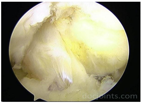
Fig. 5: Adequate tension in the anterior cruciate ligament after fixing the avulsed bony fragment

The sutures were then tied over the bony bride with the knee in 30 degree of flexion. The fragment was held reduced using the probe or blunt trocar, while the sutures were tied in tension. The stability of the fragment was re-examined with a probe, checking the reduction and stability of the fragment throughout knee flexion and extension. ACL tension was confirmed with the probe [Fig. 5].