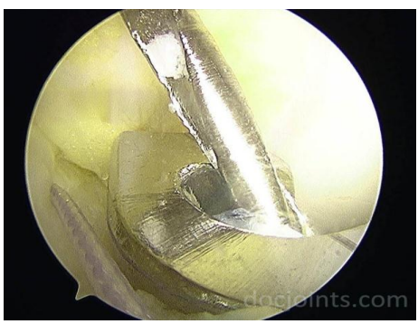
Fig. 4: Beath-pin being drilled on the side of the tibial spine fragment to pass the fibre-wire

A 3 cm longitudinal incision was made over the proximal anteromedial tibia. An ACL drill guide was used to drill two holes of 4mm on either side of the tibial spine avulsion fracture [Fig. 4]. A bony bridge of at least 2 cm was ensured between the tunnels. The intra-articular exits of the tunnels were positioned at the anteromedial and anterolateral margins of the fracture site, respectively. The medial and lateral limbs of each of the fibre wire sutures were brought out of the medial and lateral bone tunnels respectively, using a straight spinal needle with a 2-0 PDS loop loaded in it brought retrograde through the bone tunnels in tibia.