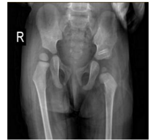
Indian Journal of Orthopaedics Surgery, January-March, 2018;4(1):53-59

Postoperative Radiograph Follow up at 12 Months