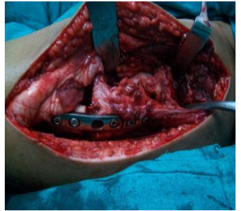
Fig. 1: Femoral shortening with varus derotation osteotomy