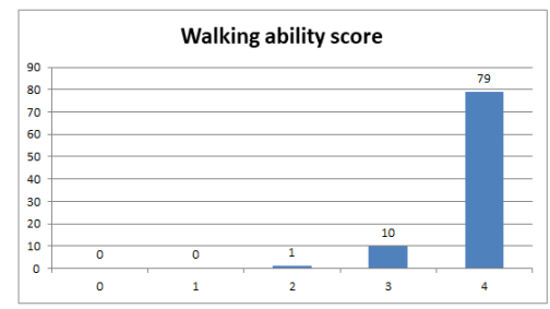
Fig. 2: Walking ability score

There were 4 cases with a varus angulation and 3 with valgus angulation at the fracture site which were less than 5 degrees. The angulations were noted at the immediate post-operative radiograph and did not show any increase in the angulation at the subsequent follow ups, till the fracture union. But there were no cases with clinical angulation at the fracture site as measured at the immediate post-operative period, subsequent follow ups till complete fracture union. There were no cases with rotational mal-alignment or any limb length discrepancy.