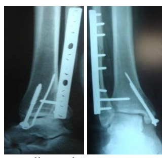
Case 2: Poor Result