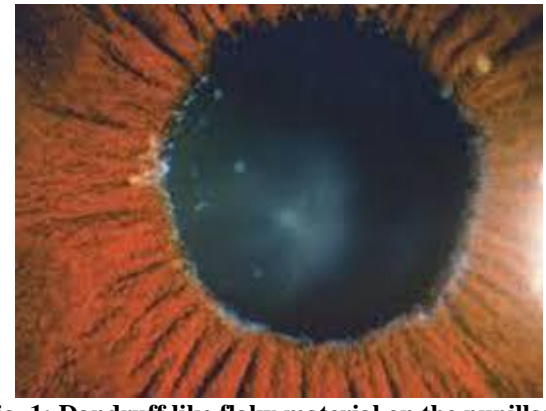
Fig. 1: Dandruff like flaky material on the pupillary margin

The functional impairment in hearing in the two groups was assessed. The hearing threshold in the better ear of the patient was taken to assess the degree of hearing loss in that patient.