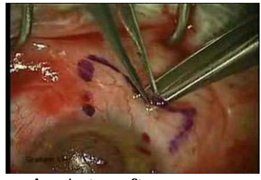
Fig. 4: Procuring Autograft