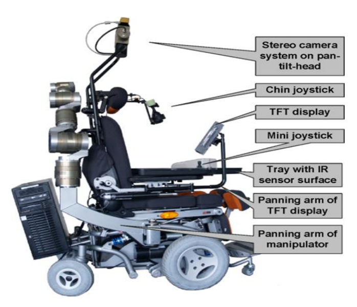
Fig. 2. The Care-Providing robot FRIEND [16]