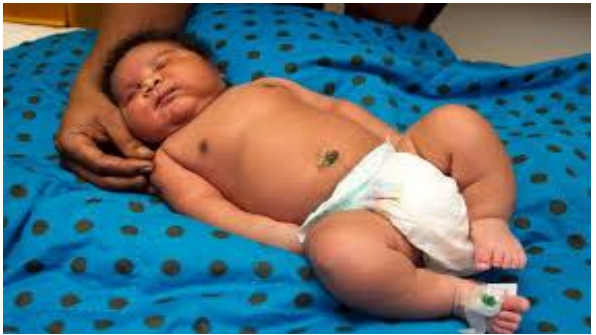
Fig. 1: Macrosomic baby