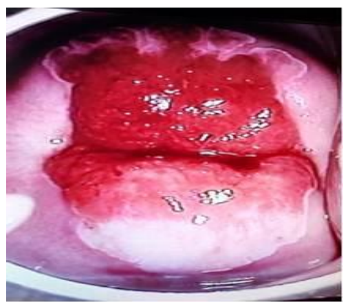
Fig. 1: Aceto grey-white lesion at 6 o'clock (VIA)

HPV genotyping was done only in the 19 preneoplastic cases to detect the presence of high risk type HPVs. HPVpositivity was found in 10 (52.63%) cases with 25% in CIN I(2/8), 66.6% in CIN II(2/3), 75% in CIN III (6/8)cases. Out of 10 cases found to be positive, HPV type 16 was found in 9 cases. It is evident that there is strong association of HPV 16 positivity with higher grade of CIN. HPV type 18 was found only in one case of CIN III(Table 3).