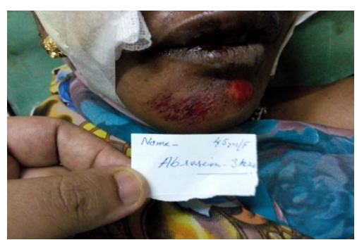
Fig. 2: Abrasion - bright red