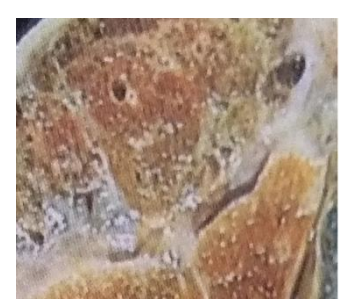
Fig. 1: Macroscopic view of lung