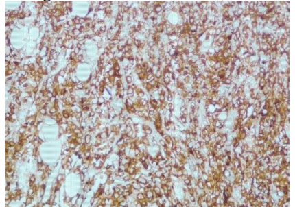
Fig. 2: Immunohistochemistry for myeloperoxidase (MPO) showing strong positivity in the tumor cells (original magnification X 200)