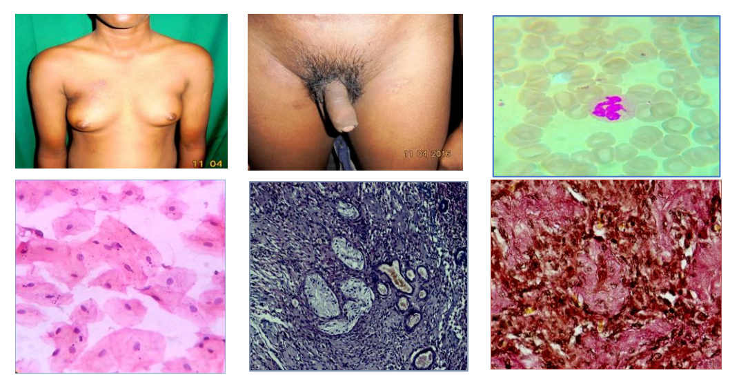
Plate 1: Klinefelters Syndrome: Fig. 1: Gynecomastia; Fig. 2: Penial hypospadias; Fig. 3&4: Barr body positive in peripheral smear and buccal smear; Fig. 5: Leydig cell hyperplasia in H&E stain; Fig. 6: Vangeison stain