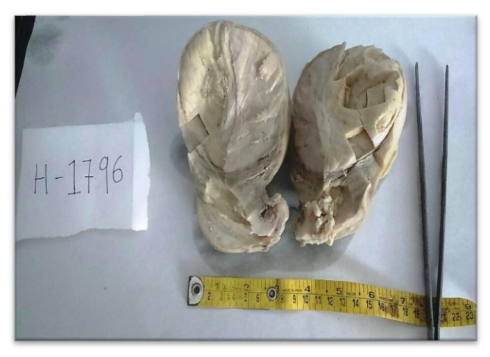
Fig. 2: Gross appearance of endometrial stromal sarcoma