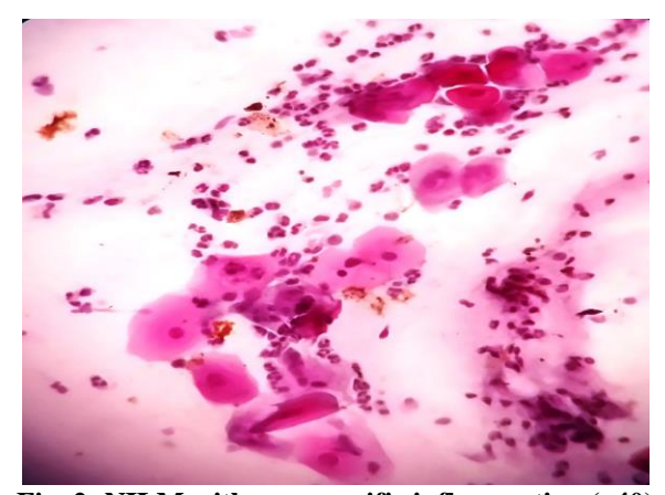
Fig. 2: NILM with non-specific inflammation (x40) Smear showing superficial squamous epithelial cells and numerous acute inflammatory cells