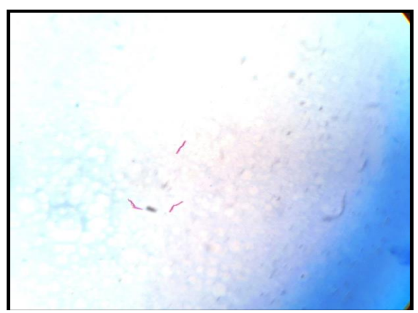
Fig. 1: Conventional Microscopy showing scattered Acid Fast Bacilli on Ziehl Neelsen Staining

PCR (100%). Among the 51 negative specimens by smear microscopy, 23 (45.1%) of these specimens were positive on PCR. This observation was in corroboration with the studies of Kumar et al<sup>22</sup> (96% in smear positive specimens and 46.3% in smear negative specimens) and Negi SS et al<sup>20</sup> (100% in smear positive specimens and 35% in smear negative specimens). Similarly, in the present study PCR had 28.2% positivity among culture negative specimens and 100% positivity in positive specimens. These findings compare favorably with Negi SS et al<sup>20</sup> and Kumar et al.<sup>22</sup>