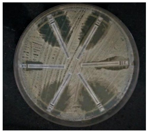
Fig. 3: Antifungal susceptibility testing of Candida spp by E-test method

The MIC range of drugs used in this study were Amphotericin B (0.002 to 32 \mu g/ml), Fluconazole (0.016 to 256 \mu g/ml), Voriconazole (0.002 to 32 \mu g/ml), Itraconazole (0.002 to 32 \mu g/ml) and Caspofungin (0.002 to 32 \mu g/ml).