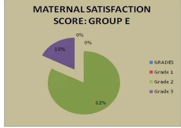
Fig. 2: Maternal satisfaction score Epidural