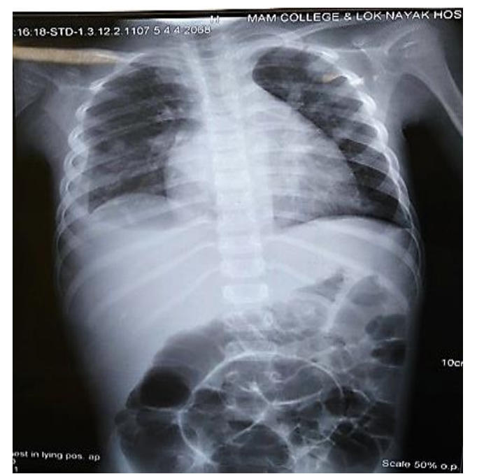
Fig. 2: Chest X ray