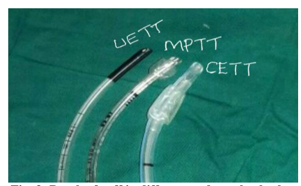
Fig. 3: Depth of cuff in different endotracheal tubes

One change with respect to murphy eye is its deletion in MPTT thereby giving space for distal placement of cuff on the shaft of MPTT. Also cuff is designed to be short enough to provide subglottic free zone when expanded, henceforth decreasing post extubation stridor. MPTT also has facilitated proper placement of cuff because of depth markings imprinted on it.