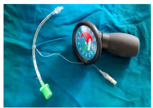
Fig. 1: Microcuff paediatric endotracheal tube and pressure transducer

ventilation. (5,6,7) With MPTT, cuff was inflated using pressure manometer(Fig. 1) to sealing pressure of 20 cm of H<sub>2</sub>O or till the leak stopped whichever was attained earlier. At 20cm of H<sub>2</sub>O of cuff sealing pressure, if still air leak was present tube was judged to be small and exchanged for next larger size(+0.5 mm). Minimal cuff pressure required to seal the airway and quality of sealing was recorded. Immediately after intubation, with either of the tubes if there was no audible air leak, the tube was judged to be bigger and exchanged for one smaller size(-0.5 mm). If there was excessive air leak with uncuffed tracheal tube not allowing adequate ventilation, it was exchanged for next larger size. Further, number of TT exchanges to find the appropriate-sized tube was recorded. Patients were maintained on O<sub>2</sub>, N<sub>2</sub>O, Inj. Atracurium 0.1mg/kg and volatile anesthetics. At the end of surgery patients were extubated after reversal with inj. Neostigmine and inj.Glycopyrrolate. Patients were observed for postextubation stridor immediately, 2<sup>nd</sup> hr and 6<sup>th</sup> hr.