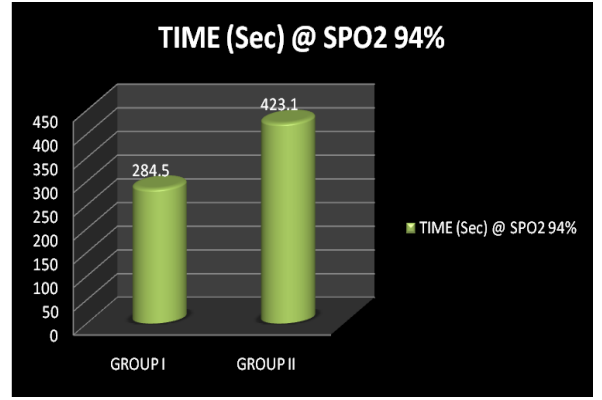
Fig. 2: Graph depicting SpO<sub>2</sub>