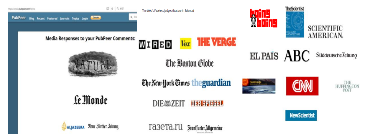
Fig. 2. PubPeer "Press" page