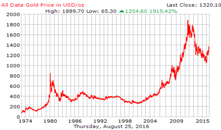
Fig. 1. Dynamics of gold prices in the period from 1973 until August 2016

Main trends of global alternative investements markets . In Figure 1 is presented the dynamics of international prices for an ounce of gold .