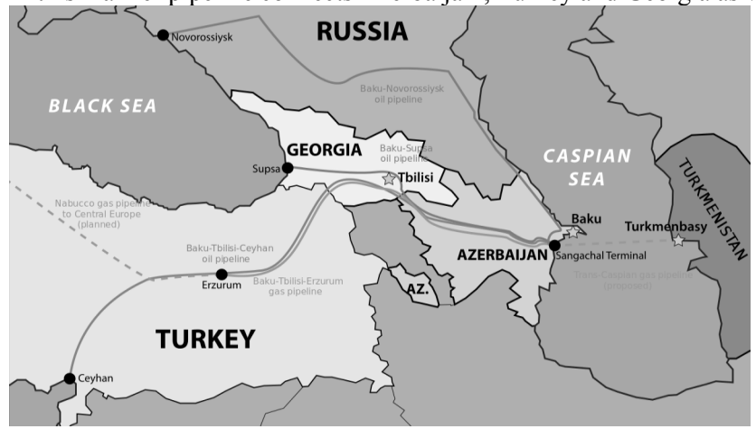
Map 3. BTE Pipeline Route

BTC was the source of inspiration in a way to construct new transport pipeline route, which is known as South Caucasus or Baku-Tbilisi-Erzurum Pipeline (BTE Pipeline). It is a natural gas pipeline that carries natural gas from Shah Deniz gas field in Azerbaijan to Turkey. It has been running paralel to the BTC pipeline. In this manner pipeline connects Azerbaijani, Turkey and Georgia as well (See Map 3).