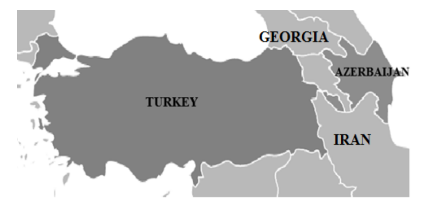
Map 1. Current Borders of Turkey, Azerbaijan, Georgia and Iran

Even if both Turkey and Azerbaijan have closed and brother relations, bilateral trade volume couldn't catch the desired level. Foreign trade of the two countries falls behind its potential due to high tariff rates. In addition to this, the lack of a direct route is an expensive problem. Export of Turkish goods to Azerbaijan is provided via Georgia or Iran that requires high transport fees (See Map 1).