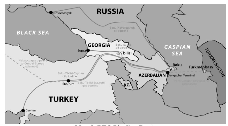
Map 2. BTC Pipeline Route

The BTC is called as the 21<sup>st</sup> century's Silk Road. Crude oil is coming to Ceyhan from Baku via Georgia through pipeline and from there it is transported to the world markets by tankers. The total lenght of pipeline is 1768 km of which 443 km exists in Azerbaijan and 249 km is located in Georgia. Accordingly, Turkey has the tallest part of the pipeline.