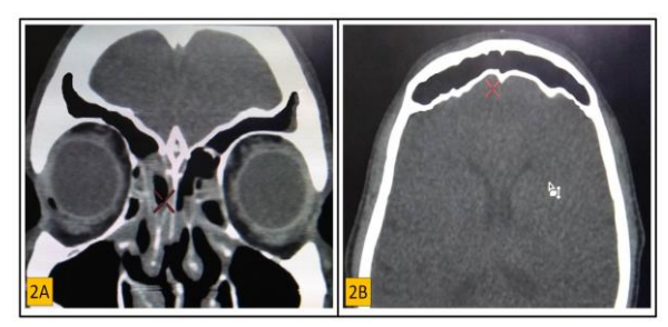
Fig. 2: shows the bilateral PDF, A) Coronal view B) Axial view. Pneumatization of frontal sinus involving the squamous part of the frontal bone.

A total of 120 (240 sides) CT scans of the nose and paranasal sinuses were reviewed. Among them 86 were males and 34 were females, age ranging between 16-68 years (mean \pm SD, 43.64 \pm 9.34 years). We observed 3 cases (2.5%) of bilateral PDF among them 2 cases were seen in males and one case in female (Figure 2). In the present study, we have not documented the unilateral PDF in CT scan images.